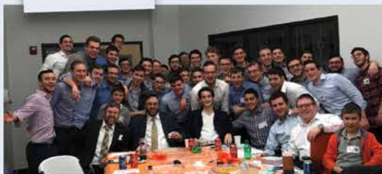
Rebbeim and Talmidim of the Beis Medrash gather for a Chanukah Mesiba at the Ranken Jordan Rehab Center