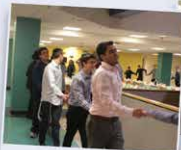
Bochurim dancing at the MTI Annual Chanukah Chagigah