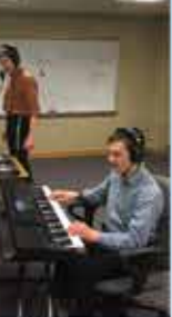
w ding o in I