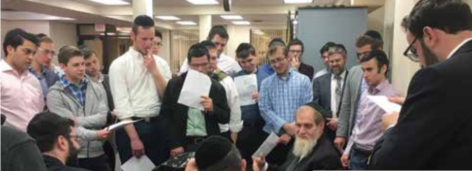
Talmidim asking questions on the shiur klali