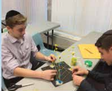
9th Graders learning to calculate construction costs

The light of the Menorah and Torah burns bright at MTI