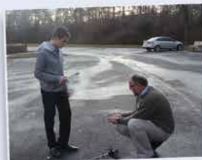
Setting up for the rocket launch