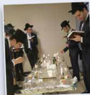
MTI bochorim lighting Chanukah candles