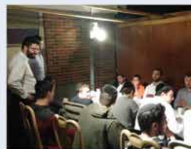
St. Louis Reunion during Sukkos