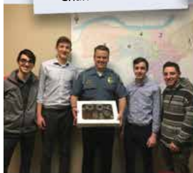
MTI Seniors showing appreciation to local law enforcement