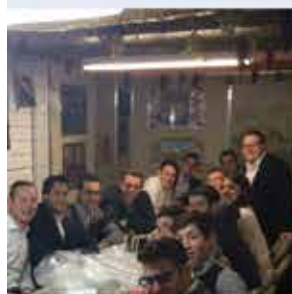
New York Reunion during Sukkos Break