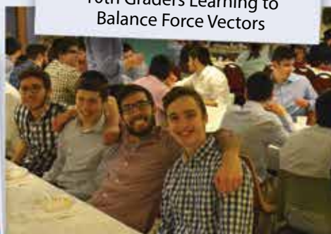
Bochrim enjoying the Yeshiva Chanukah Chagigah