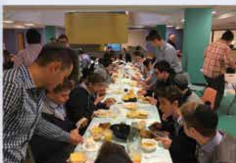
MTI Raffle Appreciation Breakfast for our hardworking boys