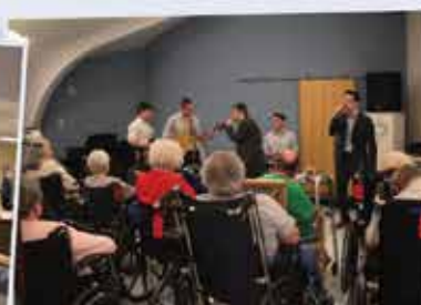
Bochurim hosting music concert at Delmar Gardens West, an assisted living facility