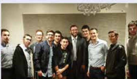
Detroit Reunion during Sukkos Break