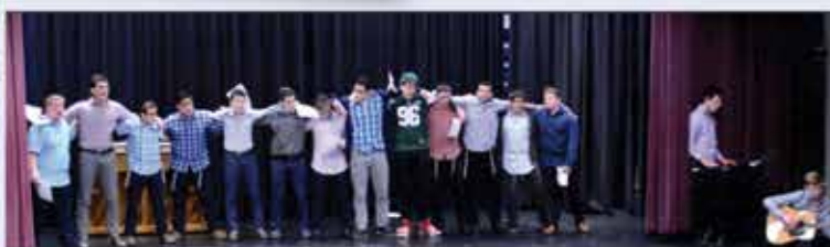
10th Graders performing at the annual MTI-Tunes at the Chanukah Chagigah