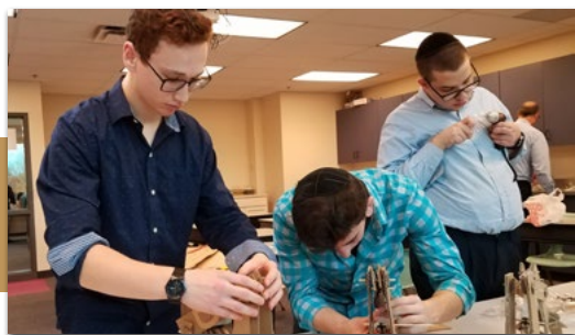
Talmidim utilizing Makerspace